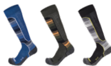
13715 TECH LIGHT M